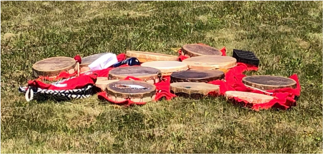
Drums at an Elders and Youth activity

K'taqmkuk is the Mi'kmaq word for Newfoundland and translates to "land across the waves/water."